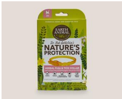
Earth Animal Herbal Flea and Tick Collar

#1 Get a fenced in yard and keep the lawn short, don't let them go out and pick up all the ticks in the woods or on shrubs.